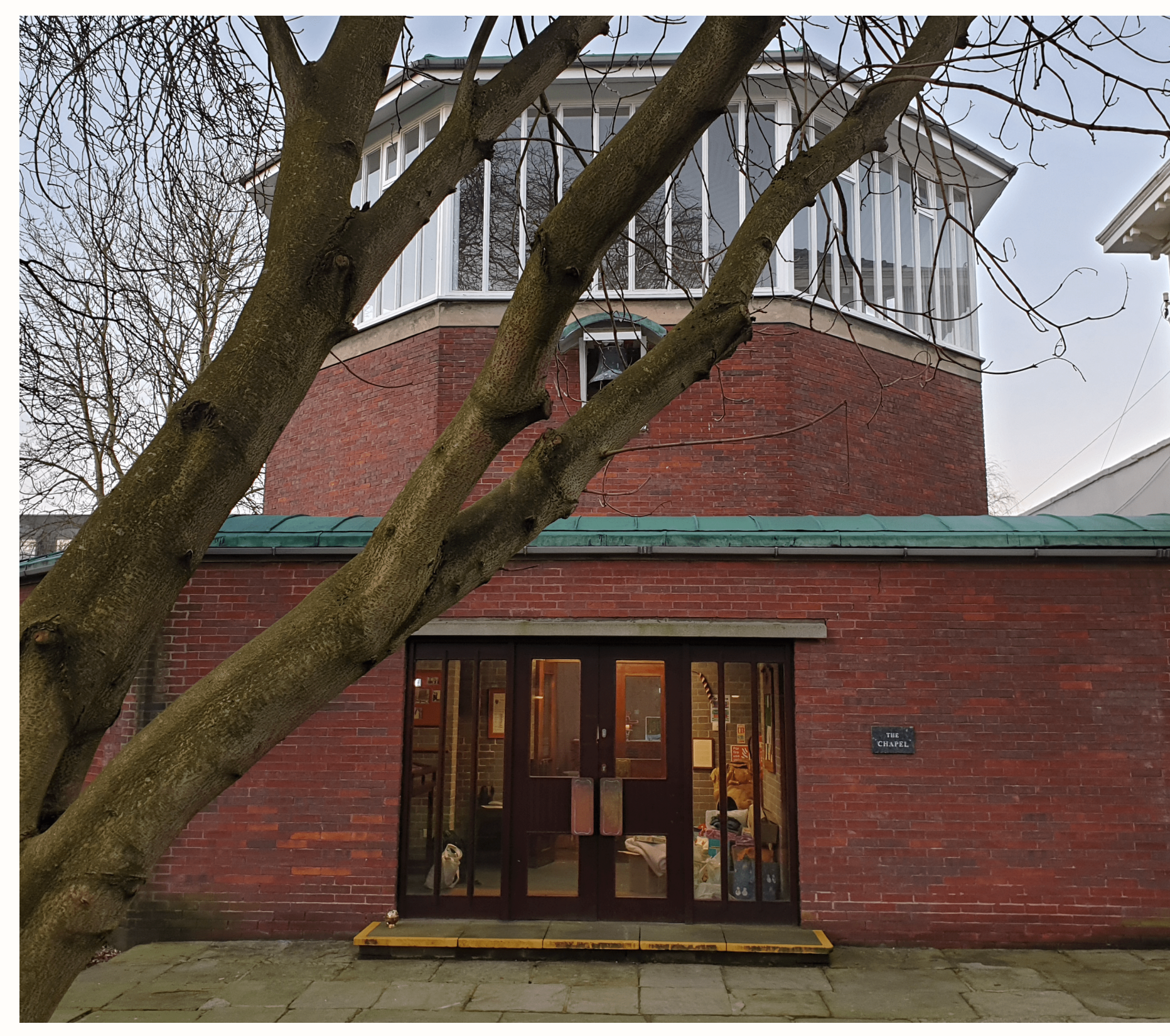
Figure 1: The Chapel of St Anselm Hall (Exterior)

The Vigil held at the chapel of St Anselm Hall this year was in support of Fortalice and the amazing work they do.