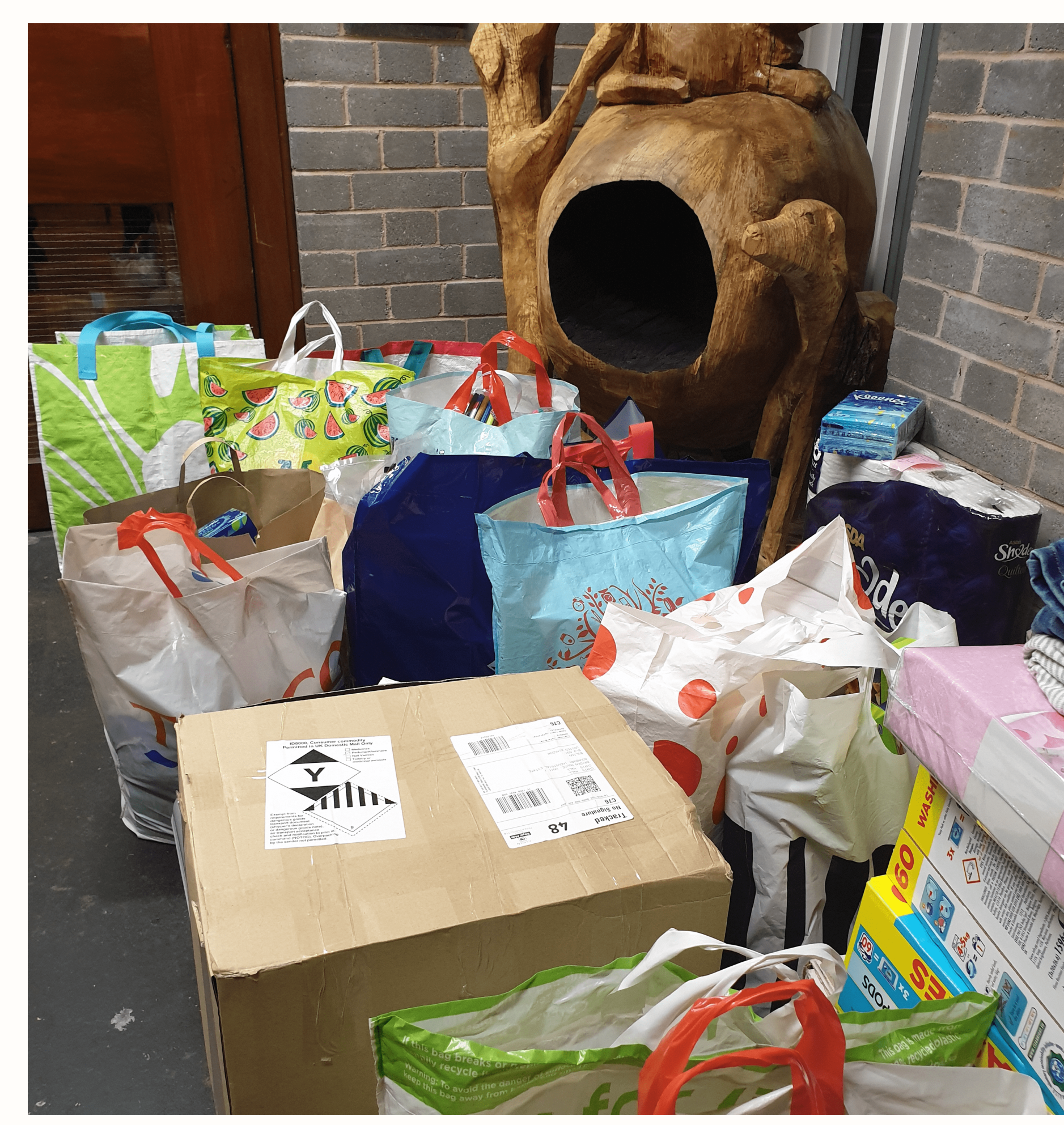
Figure 3: Donations made during the vigil

A huge thank you to all who were involved and donated, we can't do this work without you. One of our residents in the Refuge said being safe was so important for her but peoples kindness had overwhelmed her.